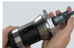
Adjust stopper shaft position