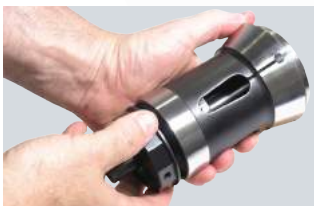
Insert collet work stopper