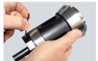
Lock stopper shaft and install