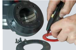
Cut out the diameter