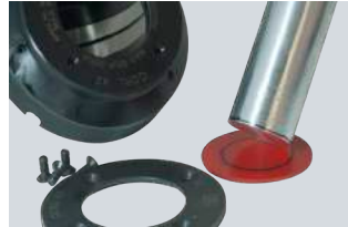
Mark the diameter you require