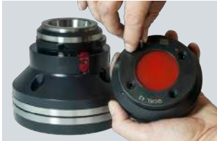
Remove bar seal from housing