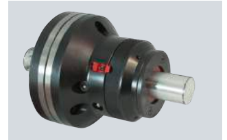
Reassemble and proceed