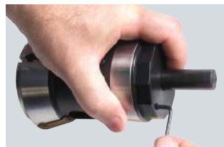
Lock stopper housing in position